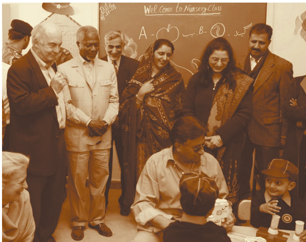
"Joint visit to a school in the affected area by (from the left) Mrs. Nane Annan, UNDP Administrator Mr. Kemal Dervis, UN Secretary-General Kofi Annan, Minister for Social Welfare and Special Education Mrs. Zubaida Jalal Khan, and President Musharraf."